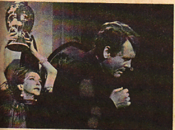
● The cameras roll, the vase is raised, and the first stage is played. . . .